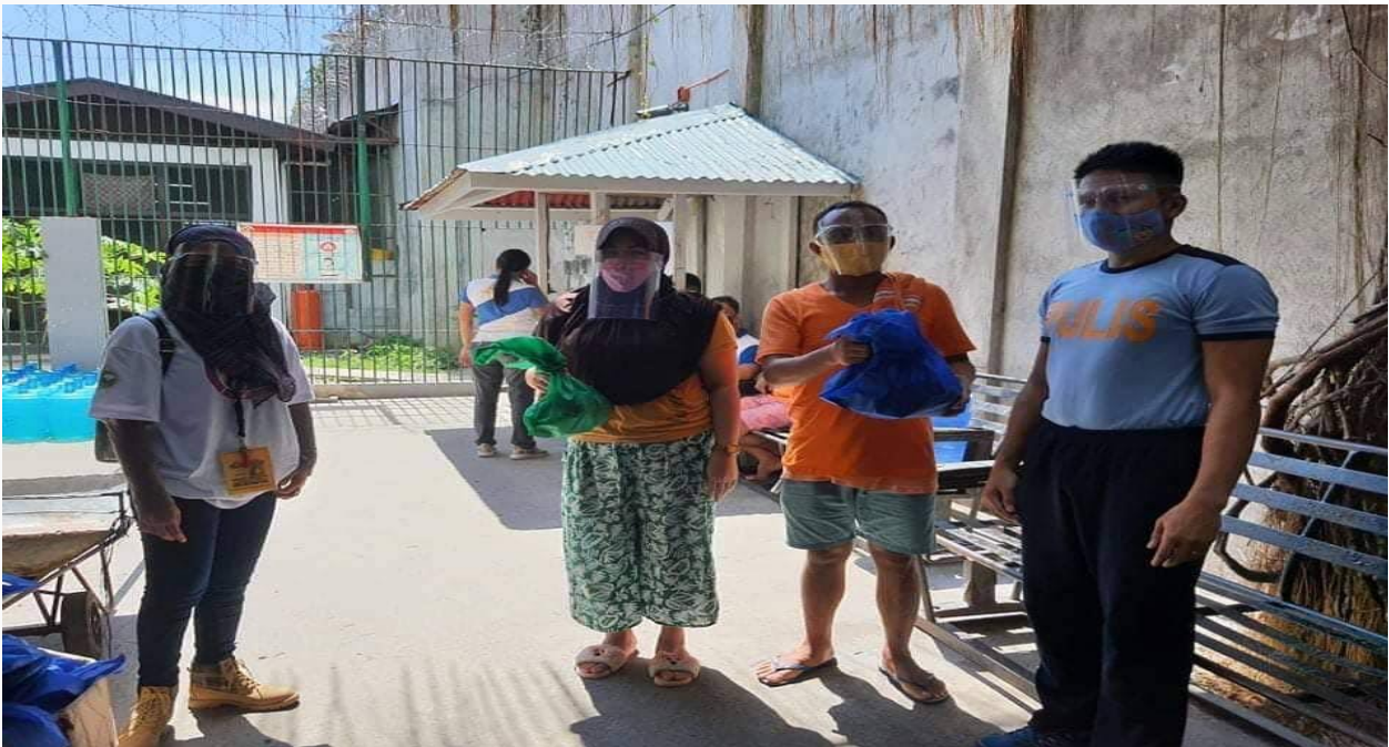
NCMF-Luzon leads distribution of hygiene packs to Pampanga Provincial Jail detainees