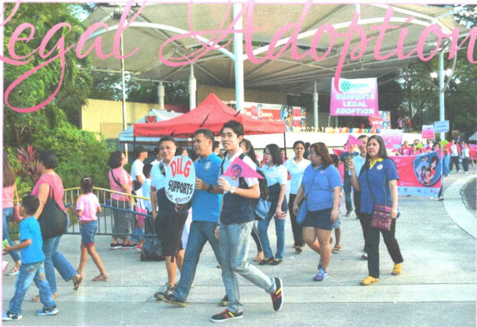
DILG personnel hold their placard and flaglet during the early morning walkathon around the premises of Quezon Memorial Circle.

In support of efforts to spread unconditional love this love month of February, the Department of the Interior and Local Government (DILG) personnel arose very early on February 11 and headed towards Liwasang Aurora at the Quezon Memorial Circle, Quezon City to join the Legal Adoption Campaign spearheaded by the Department of Social Welfare and Development (DSWD).